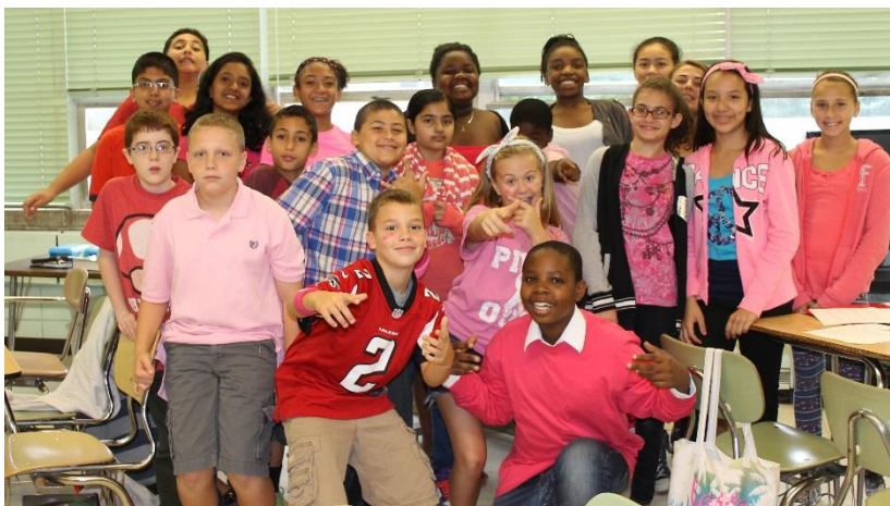
A 6 th grade homeroom shows their support for Breast Cancer Awareness.